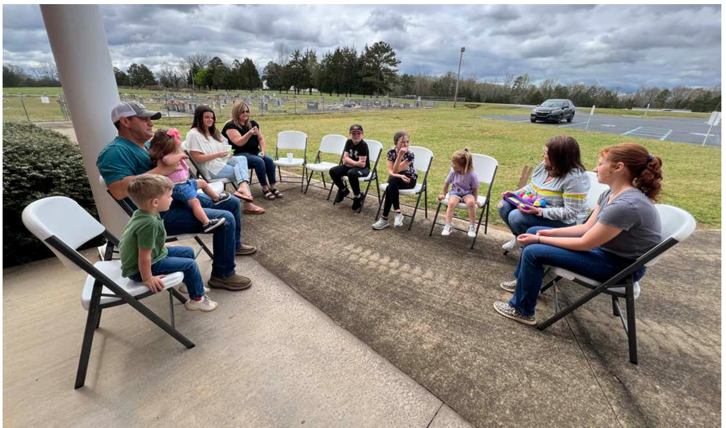
Everyone listens to a special Easter lesson told through Resurrection Eggs.