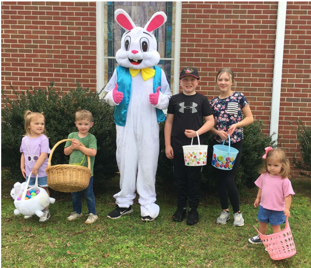
Ready to hunt eggs with the Easter Bunny!