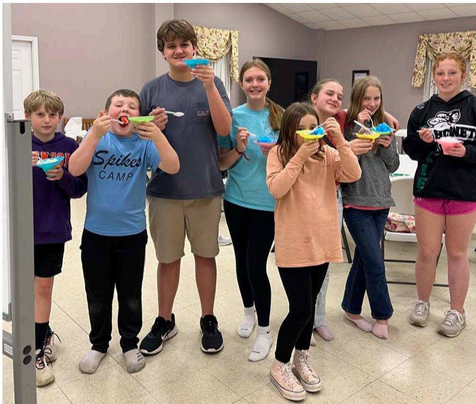
LMPC Youth enjoy snow cones from our new snow cone machine!

Our upcoming event is the Spring Fling on April 13 from 4 to 7 p.m. We will be working with The Fellowship Committee to plan a great time of fun and fellowship for all ages.